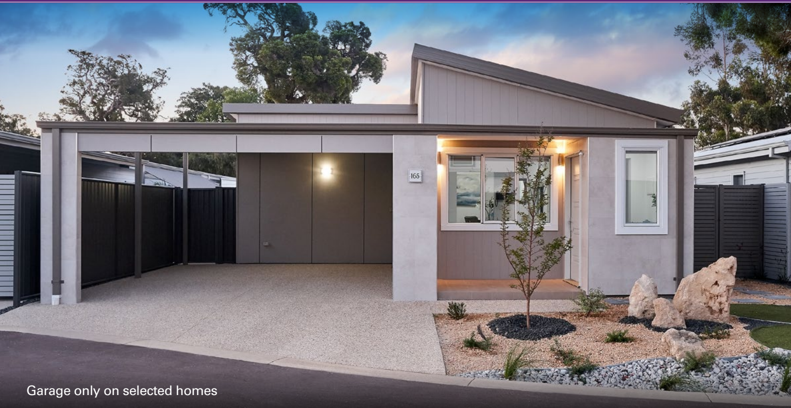
Garage only on selected homes