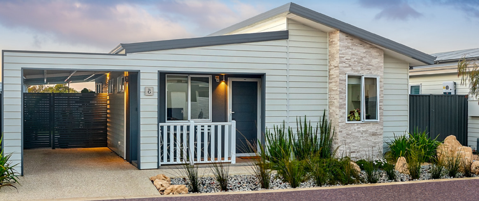
Garage only on selected homes