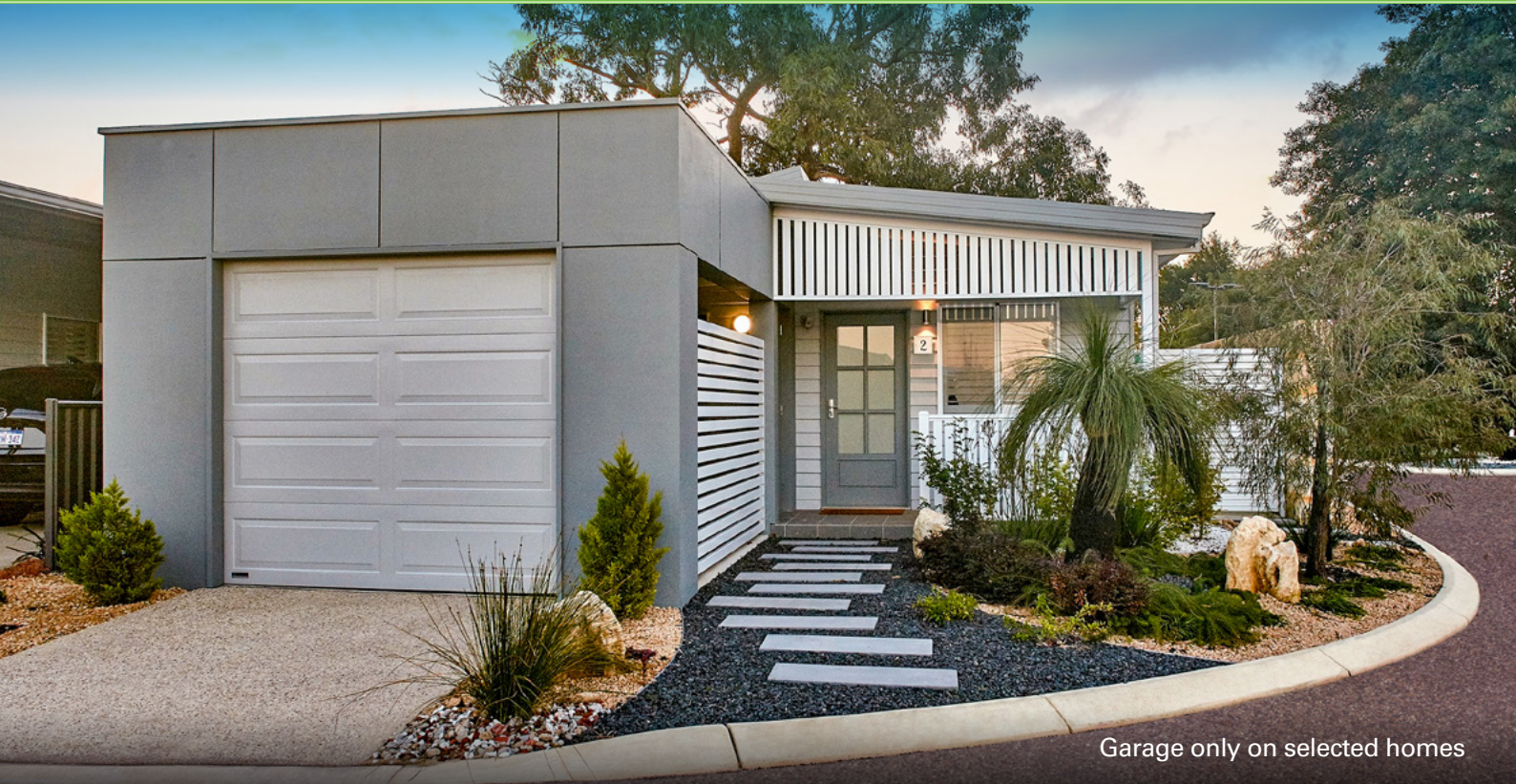
Garage only on selected homes